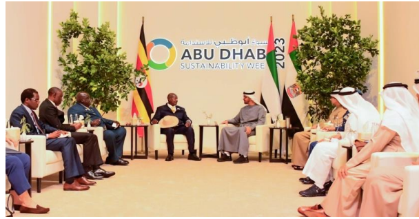
H.E YKT Museveni at the ADSW

International fora serve many diverse functions, including collecting information and monitoring trends, delivering services and aid, and providing forums for bargaining and settling disputes.