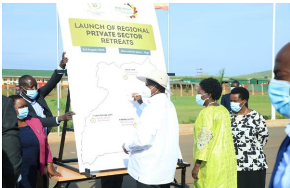
The President launching the regional retreats

The fourth edition of the bi-annual private sector CEOs Retreat was convened by the Presidential CEO Forum together with the Office of the Prime Minister in collaboration with the Science, Technology and Innovation Secretariat, National Planning Authority, and Kiira Motors Corporation, on 2 nd -3 rd August 2023 under the theme, ‘Uganda’s Industrialization Agenda: Positioning Uganda as a net source of E-mobility Solutions in Africa’ .