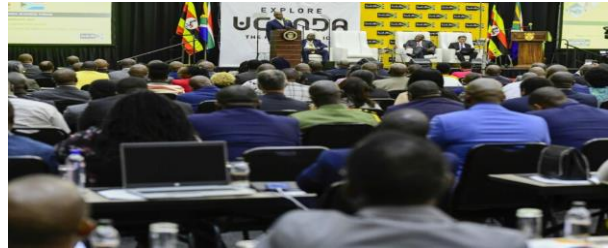
H.E YKT Museveni & H.E Ramaphosa at the SA-UG Investment Summit