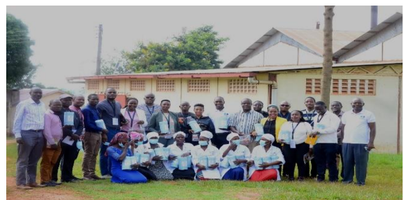
Group photo at Mutuma Commercial Agencies Limited

We are looking forward to what the second half of the year holds for PCF and the various programs under it.