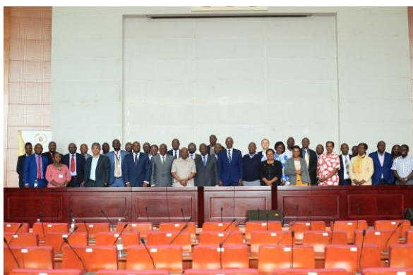
Group picture after the meeting