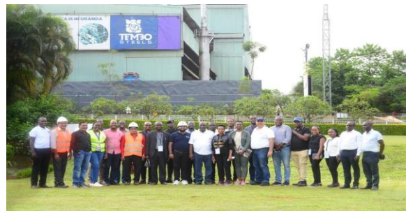
Group Photo at Tembo Steels