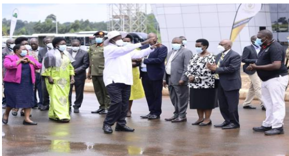
President YKT Museveni arriving for the 4 th BAR